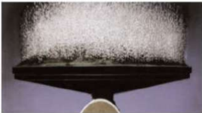
Fine Bubble Aerator