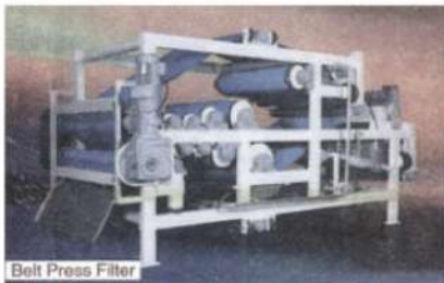
Belt Press Filter